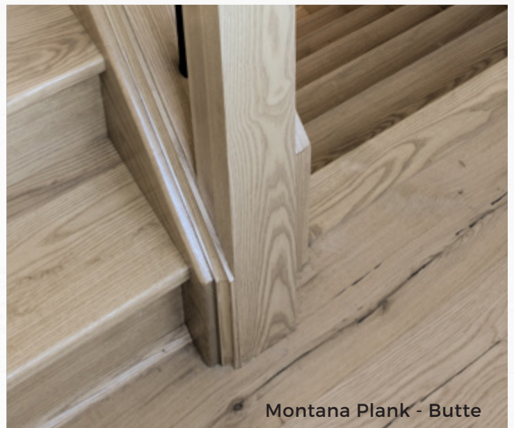
Montana Plank - Butte