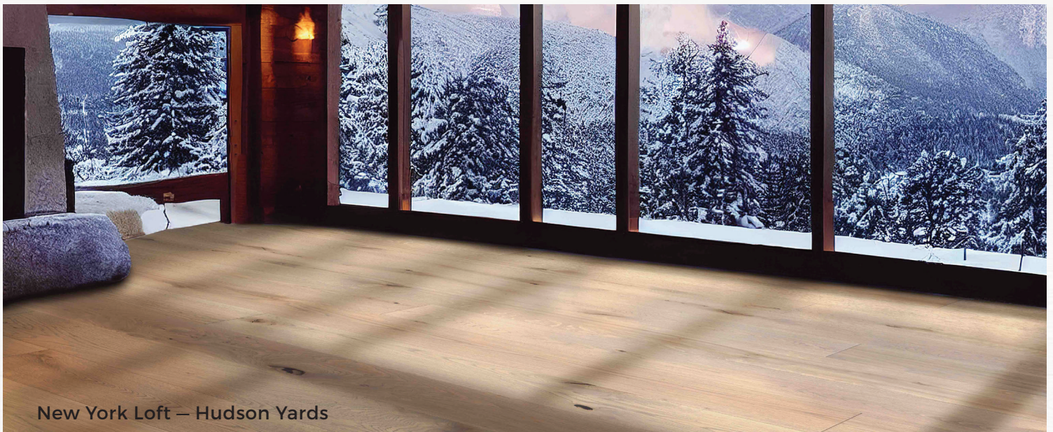
New York Loft — Hudson Yards