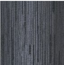
#05 Leaning Grey